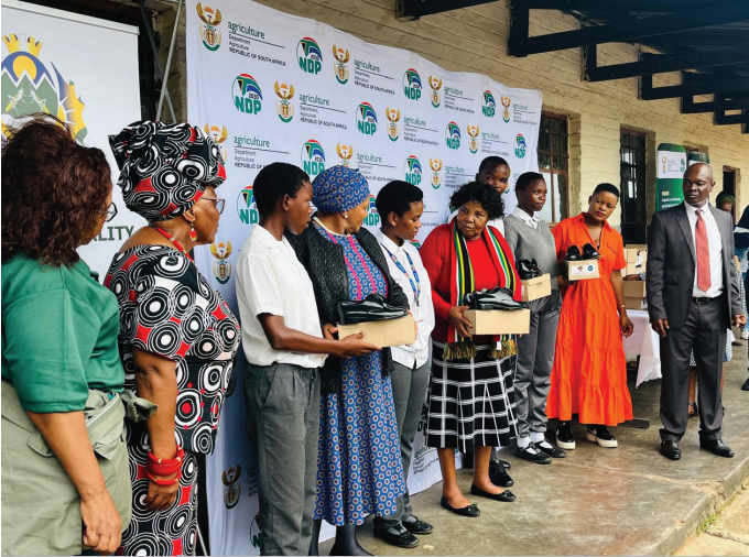
Deputy Minister Capa encouraging girls at Maqhawe Secondary School to explore agriculture