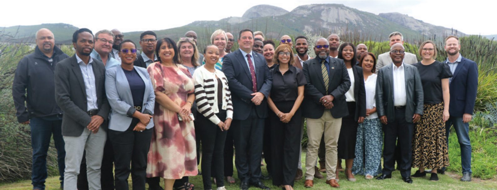
Minister John Steenhuisen met with leaders of organisations representing the horticulture sector