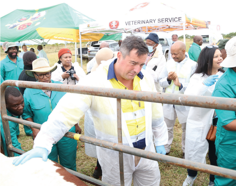
Minister John Steenhuisen witnessed the vaccination of cattle in Limpopo

Minister Steenhuisen noted that the lack of a proper border fence between South Africa and Zimbabwe as well as damaged redline fences are contributing to the spread of FMD in Limpopo. "We are waiting for the arrival of the next shipment of millions of vaccines from Biogénesis Bagó and Dollvet. This will help us reach our target of vaccinating 80% of the national herd by December this year. I would like to thank all our veterinarians on the frontline in the fight against FMD. Let us continue working together to overcome this challenge," he said.