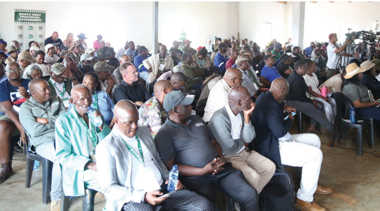
Livestock farmers of Ramotshere Moiloa Local Municipality during the FMD engagement in North West