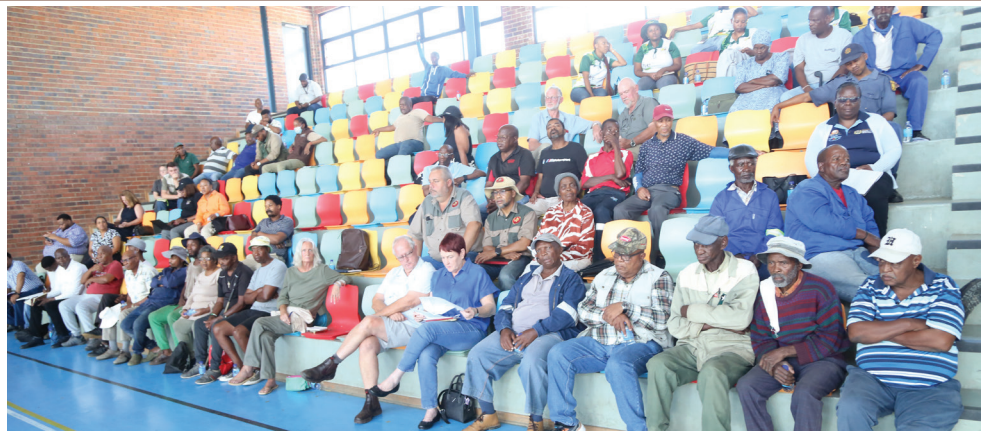
Farmers of Ngwathe Local Municipality during their FMD engagement with Portfolio Committee on Agriculture in Parys