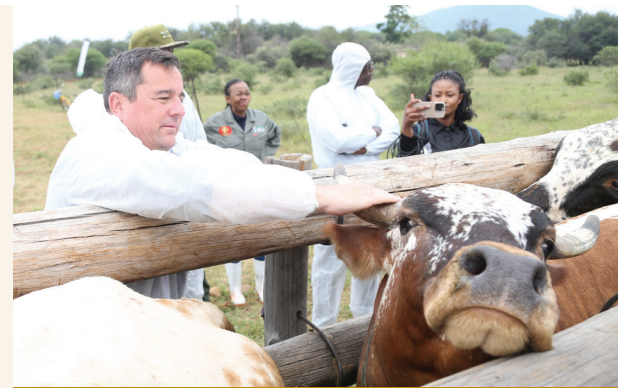
Minister John Steenhuisen checking the cattle during the FMD vaccination drive in Swartkopfontein

Minister Steenhuisen stated that the department is collaborating closely with its regional counterparts in the Southern African region to develop a unified approach to the FMD outbreak. "We continue to work with Botswana and must foster regional cooperation by sharing knowledge and experiences with our neighbouring country. We are committed to combating FMD, and North West is a province that gets things done. I want to thank all state and private veterinarians who are conducting vaccinations on the ground. We are going to prioritise the issue of border fencing and tighten controls," he said.