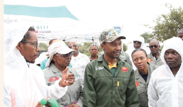
State vets from North West Department of Agriculture and Rural Development getting ready to vaccinate cattle during the FMD vaccination drive