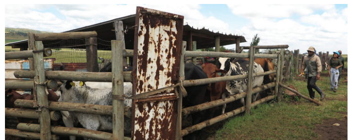
Foot and mouth disease spread in communal kraals is a major driver of the recent outbreaks

The aim is to vaccinate 80% of the national herd by December and reduce the outbreaks by 70%.