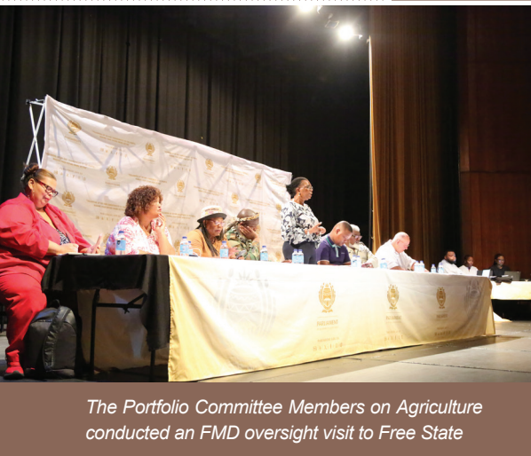
The Portfolio Committee Members on Agriculture conducted an FMD oversight visit to Free State