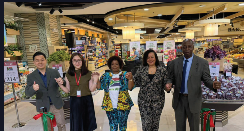
Celebrating arrival of the first shipment of South African grapes to the Philippines in Manila