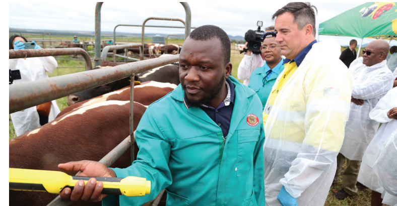
Minister John Steenhuisen observing the vaccination of cattle at ZZ2 Kareebosch Farm in Limpopo

Thousands of cattle have already been vaccinated in the fight against FMD across the provinces. The 67 cattle at ZZ2 Kareebosch Farm tested positive in February and the farmer immediately alerted the department. Following this, provincial veterinary services worked closely with the farmer to contain the outbreak and prevent further spread. All the animals remain