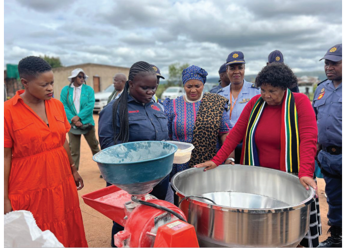
A poultry farmer at Lungile Poultry Farmer showcasing her operation, demonstrating how small-scale farming supports local economies

Deputy Minister Nokuzola Capa brought more than just a message of support to Ga-Morwe in the Dr JS Moroka Local Municipality: she brought visibility, recognition and renewed energy to women shaping the future of agriculture in Mpumalanga. Marking International Women's Day, the outreach programme became a dynamic exchange between Government and community, with rural women farmers taking centre stage.