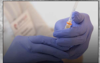
Rotary Family Health Day outreach campaign