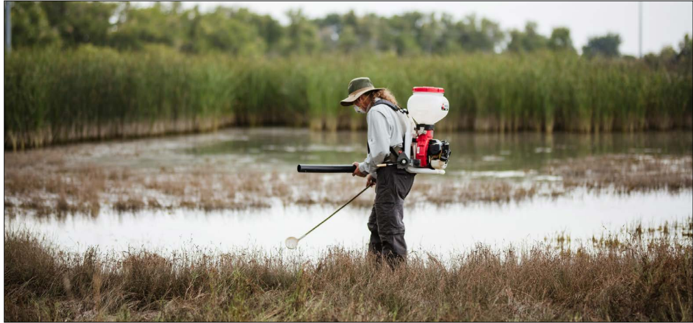
Mosquito control measures

The SADC Malaria Day commemoration is aimed at reflecting and creating awareness on malaria and to mobilise communities to participate in the malaria control programmes. The communities are mobilised through health education to create awareness and are taught to recognise signs and symptoms of malaria to seek immediate treatment when feeling sick.