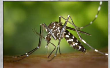
Southern African Development Community (SADC) targets to eliminate malaria by 2030