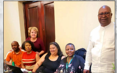
Dalrrd senior managers embrace gender mainstreaming training