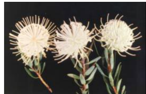
Fleur du Cap